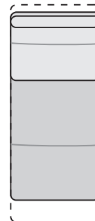
KF80 manually adjustable chaise 32/67/37/20